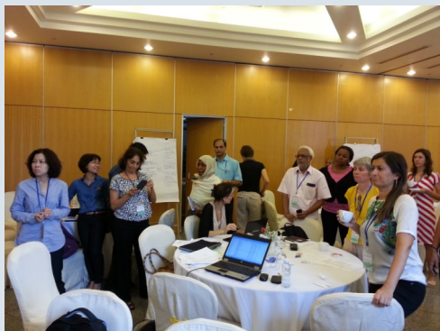
Feedback & Evaluation Activities