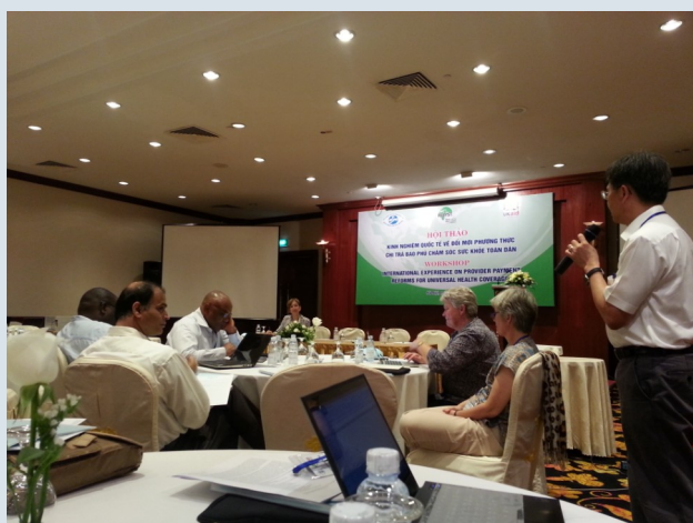
Country Progress Report Session